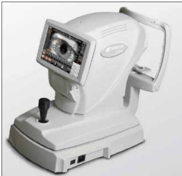
Figure 1. The KR-800S Auto Kerato/Refractometer incorporates subjective visual acuity testing along with autorefraction.